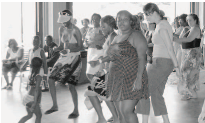
Staff and their families enjoyed the Annual Employee Picnic.

The culture change journey is the fruit of a unique relationship between management and labor. Jewish Home has been working with 1199 SEIU, a healthcare workers union, to put the needs of residents first and transform the environment of the nursing home.